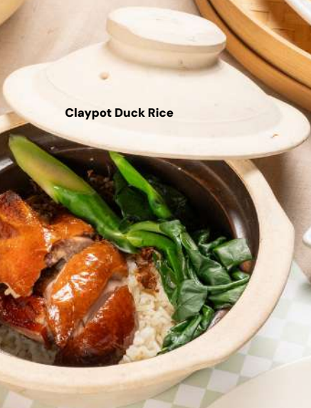
Claypot Duck Rice