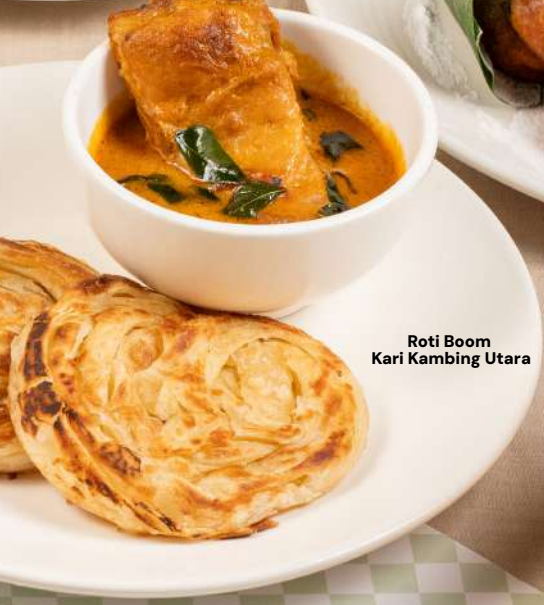
Roti Boom Kari Kambing Utara