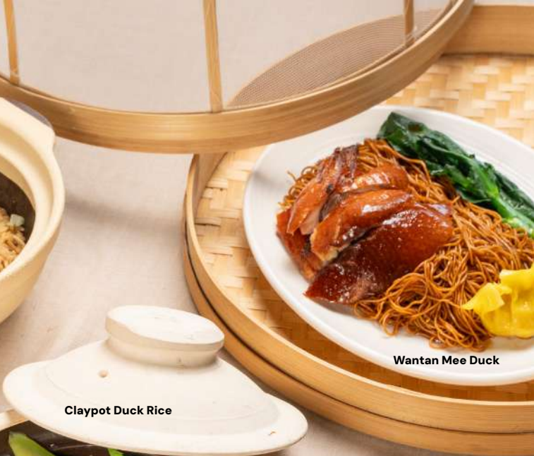
Wantan Mee Duck