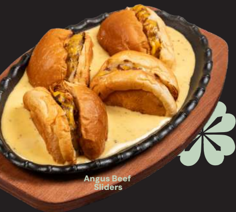
Angus Beef Sliders

Smashed Angus beef, crispy shallots, cheese.